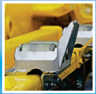
Zinc-plated container supports