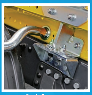
Subframe support brackets